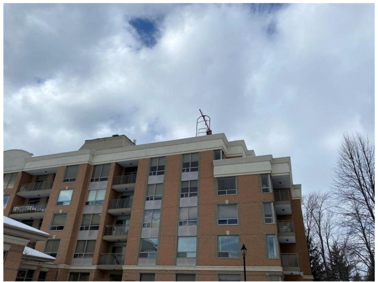
Feb 22, 2022 @ 14:32 PM

Yes, there are high parapet walls in place around the perimeter of the building to protect the public from roofing operations.